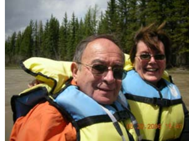
Rafting on the Snake River