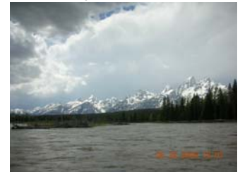
Grand Tetons from the Snake River in Wyoming